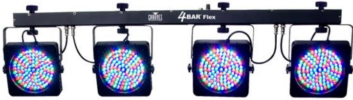
Shown with 4, Intimidator Scan LED 100 fixtures mounted on and powered by the 4BAR Flex